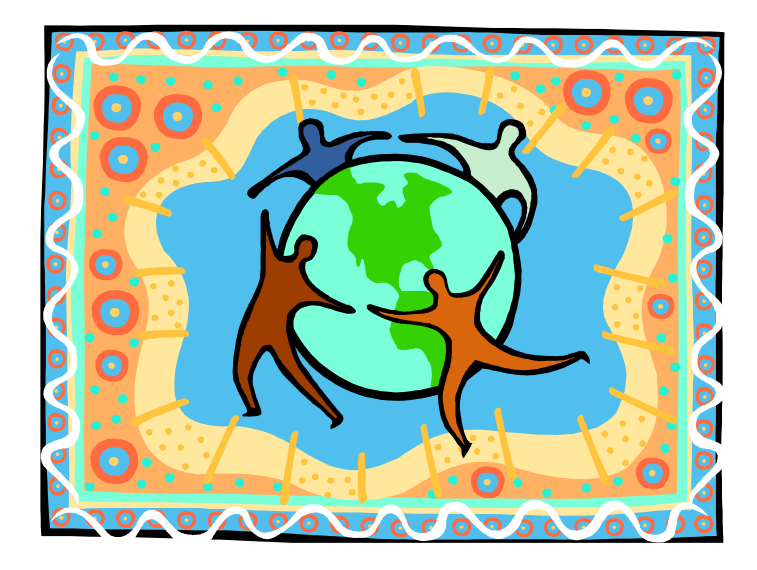
Let's begin to understand and learn about NPS pollution and what YOU can do to save the earth...

Preventing pollution will require an informed citizenry capable of understanding the complex issues surrounding how pollution occurs and motivating all of us to take action. The goal of this guide is to help teachers guide their students toward gaining awareness and protecting our valuable water resources.